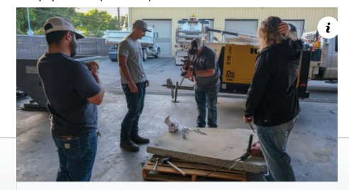
turlockjournal.com TID offers skills course for community members

The Turlock Irrigation District's inaugural Construction and Maintenance Skills Series taught community members who were accepted into the program skills like plumbing, electrical, concrete, welding, confined-space pipeline training, heavy-equipment operation, and more.