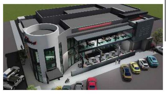
Nivel Restaurant and Lounge will cover nearly 6,000 square feet at 309 N. Center St., be within the city height limits of 40 feet and have multiple outdoor seating areas on both floors (Photo contributed).